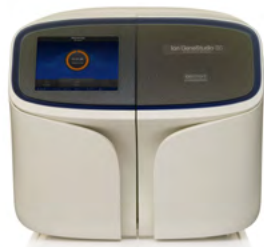
Ion GeneStudio S5 System