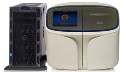
Ion GeneStudio S5 Prime System