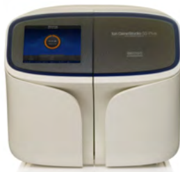
Ion GeneStudio S5 Plus System